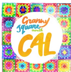
Square 25 - @made.by.hem