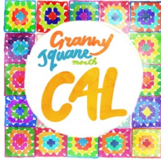
Square 20 - @littlilactimecrochet