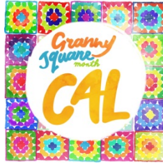
Square 19 - @crochet.love.happy